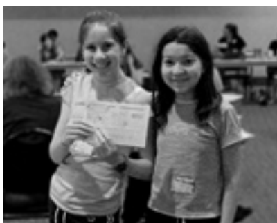
The matching donor program for new and increased gifts raised over $20,000 from over 450 qualifying donors!