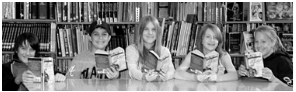
Middle school students get to enjoy Hamlet literature books thanks to our business sponsors.