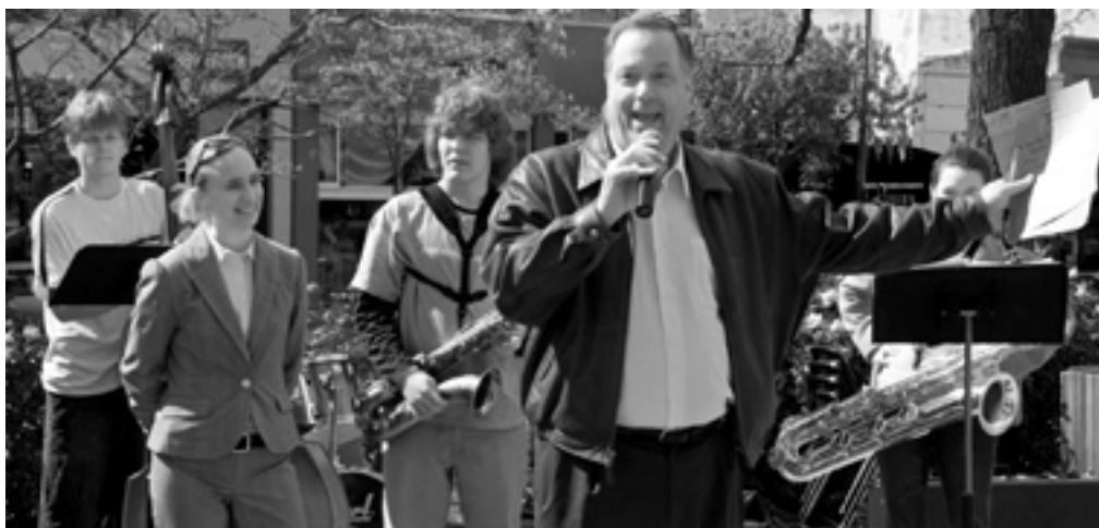
Kicking off the Fund Drive with the AHS Jazz Band.