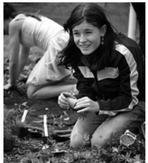
Middle school students planting lupin.

Each student researched and presented to their peers 1 of 31 different plant species. Then, using math grids, they designed their garden space, prepared the soil, germinated seeds and planted the garden.